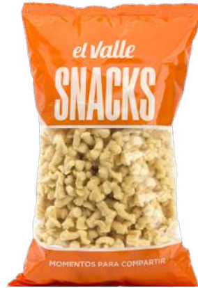
■ BUTTER POPCORN