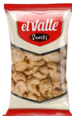
■ PORK CRUST SNACK