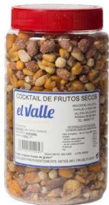
ROASTED NUT MIX