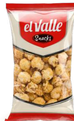
■ CARAMEL POPCORN