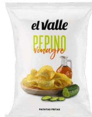
CUCUMBER & VINEGAR