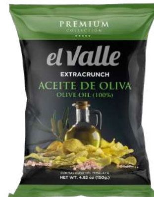
OLIVE OIL & PINK SALT