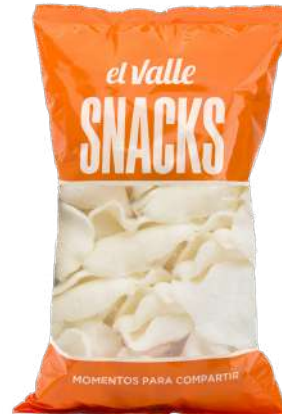
■ PRAWN BREAD