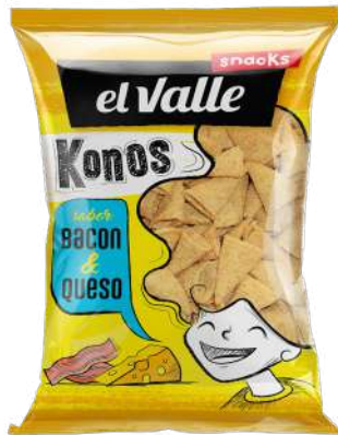
BACON & CHEESE KONOS