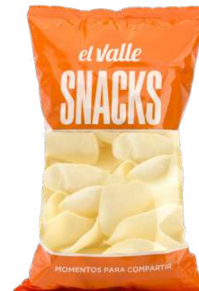
■ CHIC POTATOES