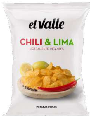
CHILI & LIME