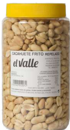
FRIED PEANUT WITHOUT SKIN