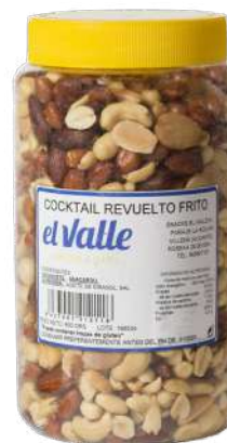
FRIED SCRAMBLED MIX NUTS