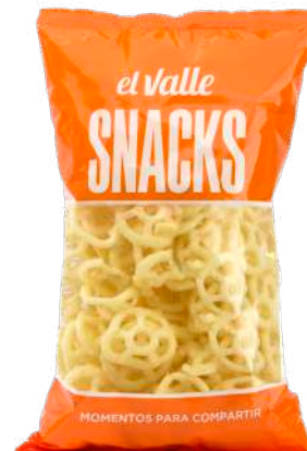
■ POTATO WHEELS