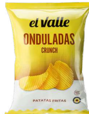
WAVY POTATO CHIPS