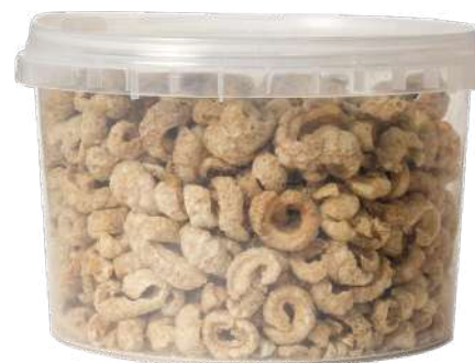
IBERIAN FLAVOUR CRUSTS