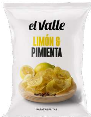
LEMON & PEPPER