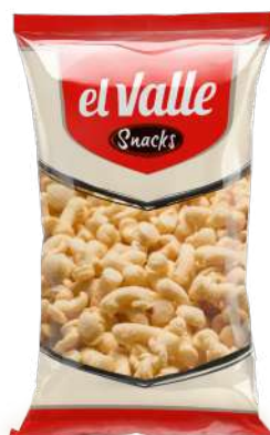
■ BUTTER POPCORN