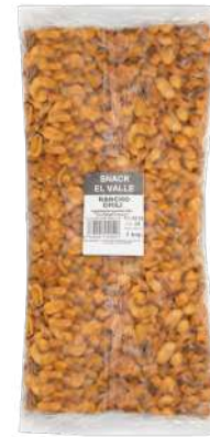
NUTS WITH CHILI