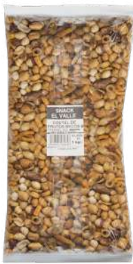
MIXED NUTS IN BAG