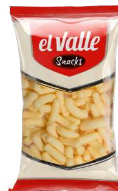
■ ORIGINAL BAKED SNACK