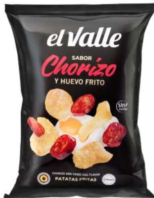
CHORIZO & FRIED EGG