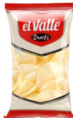
■ CHIC POTATOES