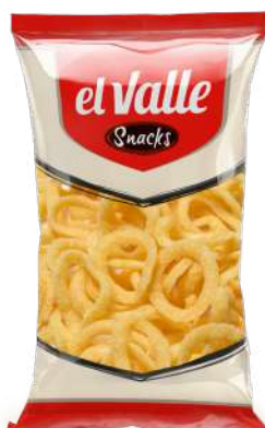
■ ONION RINGS