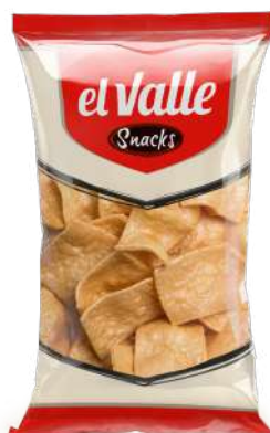
■ WHEAT BARK SNACK