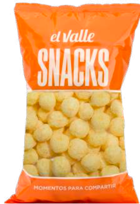
■ CHEESE BALLS