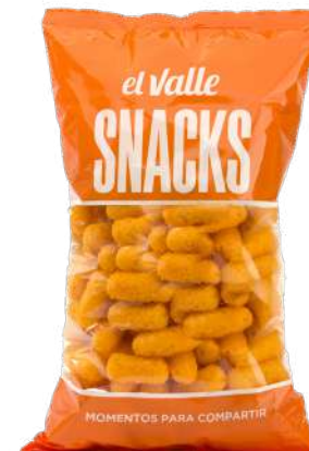
■ RED FAT BAKED SNACKS