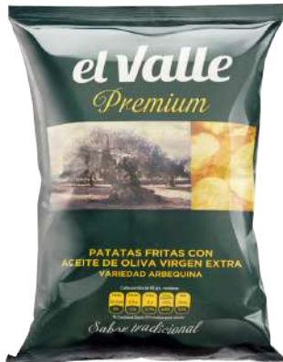
PREMIUM OLIVE OIL