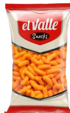
■ RED FINE BAKED SNACK