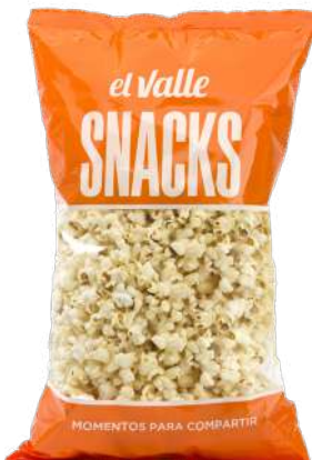
■ SALTED POPCORN