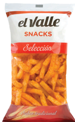
■ CHEESE SHAPES