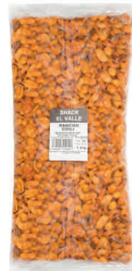
MIXED NUTS WITH CHILI