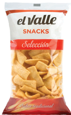
■ WHEAT CRISPS