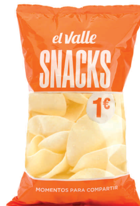
■ PRAWN CRACKERS