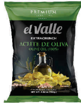
OLIVE OIL AND HIMALAYAN SALT