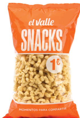
■ BUTTER POPCORN