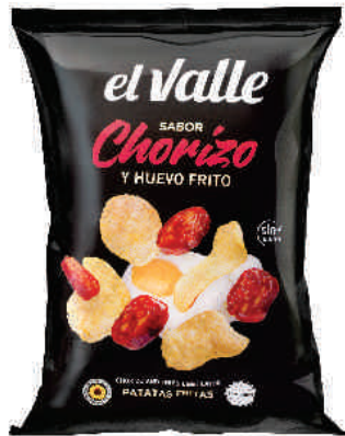
CHORIZO AND FRIED EGG