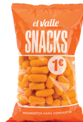
■ RED CORN PUFFS