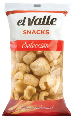
■ PORK SCRATCHINGS