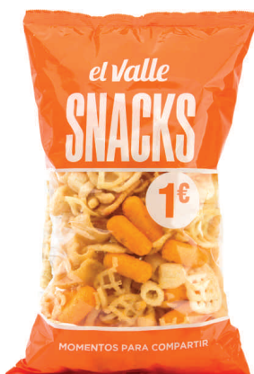
■ COCKTAIL SNACKS