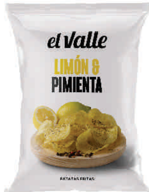
LEMON & PEPPER