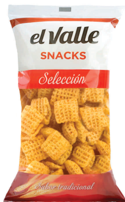
■ MINI SQUARES