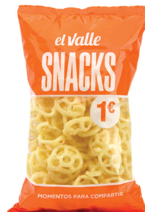
■ POTATO WHEELS