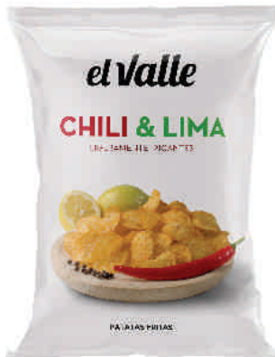
CHILI & LIME