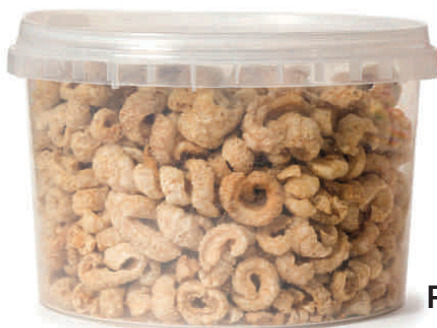
FRIED PORK SCRATCHINGS