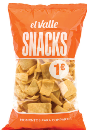
■ WHEAT CRISPS