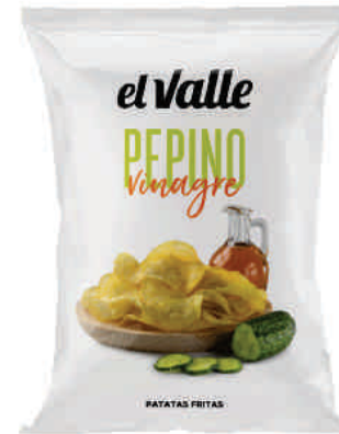
CUCUMBER AND VINEGAR