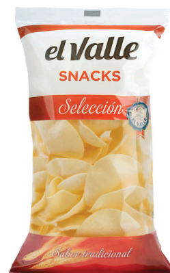
■ CHIC POTATOES