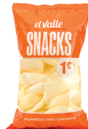
■ CHIC POTATOES