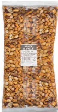
BAGGED MIXED NUTS