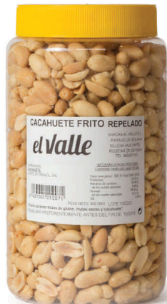
CLASSIC FRIED PEANUTS