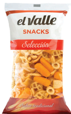
■ COCKTAIL SNACKS