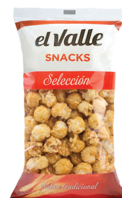
■ TOFFEE POPCORN