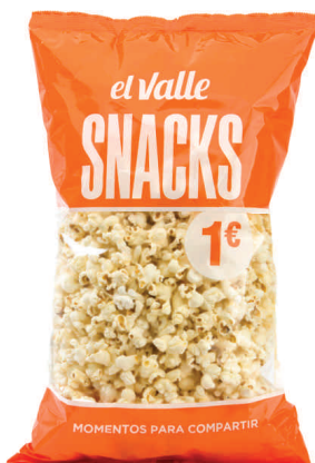
■ SALTED POPCORN