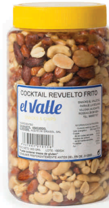
FRIED MIXED NUTS