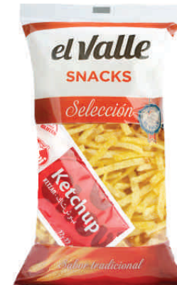
■ STRAW POTATOES WITH KETCHUP